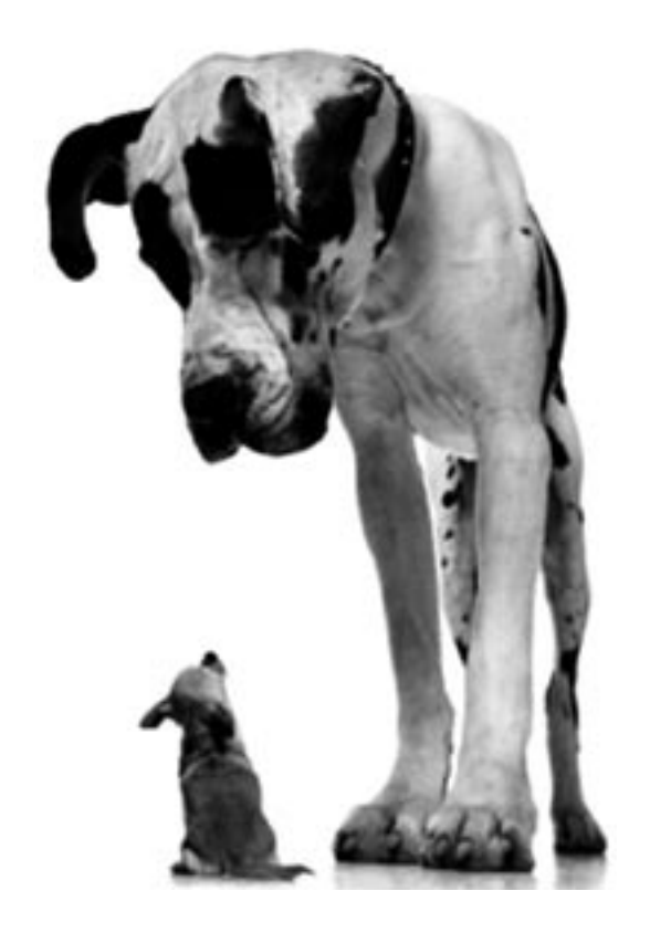
The "Big Dogs" are sites like Amazon, EBay, Fortune 500 companies, top 1000 Alexa ranked sites from Multinational companies etc. Now you can get this knowledge too with "How To Make Money Online"