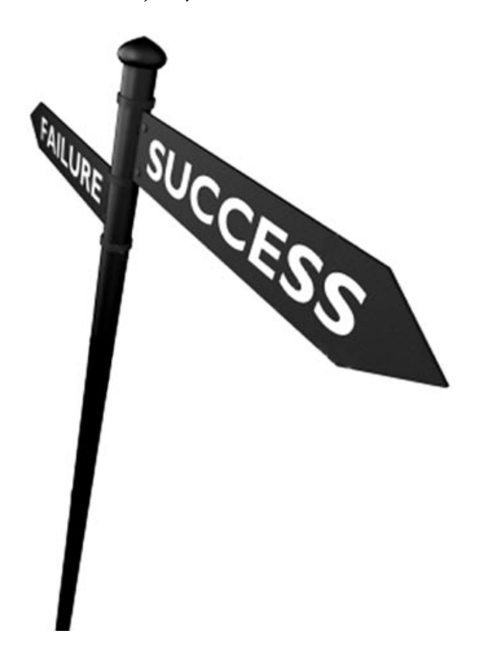
"Success is a journey, not a destination." Ben Sweetland